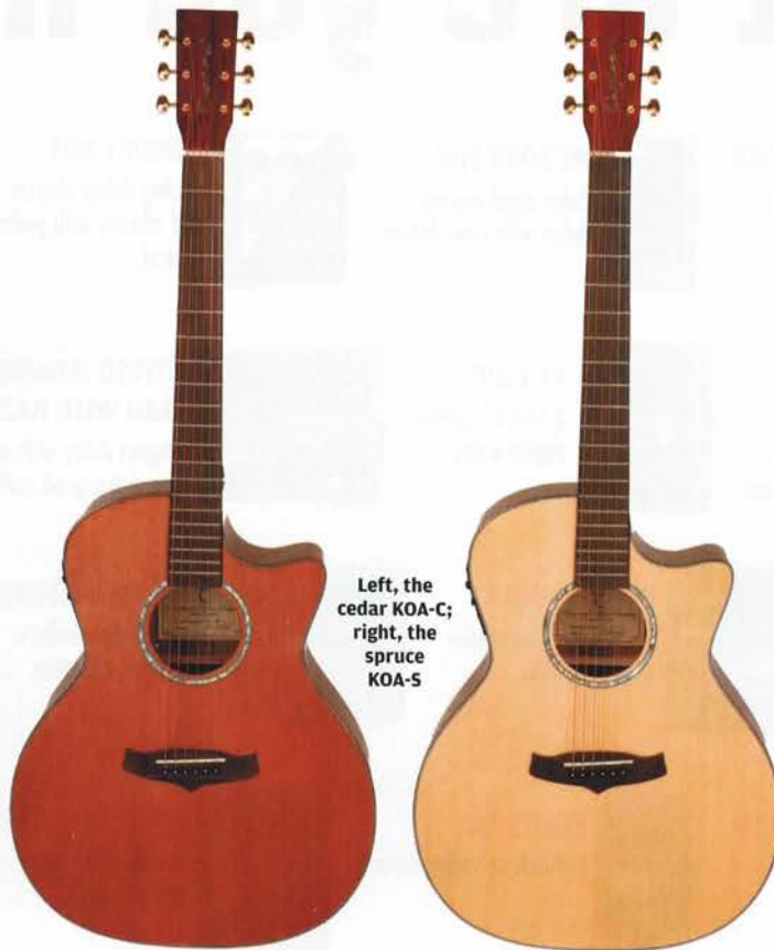
Left, the cedar KOA-C; right, the spruce KOA-S