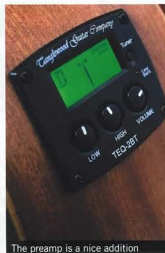
The preamp is a nice addition

The finish of the guitars is completed with a natural matt lacquer which has a very transparent quality. You therefore have a very true representation of the tonewood grain which lies beneath, so there is no hiding behind any sun- or tobacco-burst finishes; this results in very honest-looking instruments which have been put together with a total focus on a no-nonsense ethic. There is a little bit of subtle detailing to be enjoyed at the rosette where a lightly green-coloured mother-of-pearl-style inlay has been used on the SFCE model. It's understated and quite smart. Generally there is not much in the way of visual contrast, so