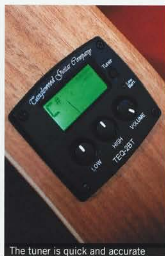
The tuner is quick and accurate