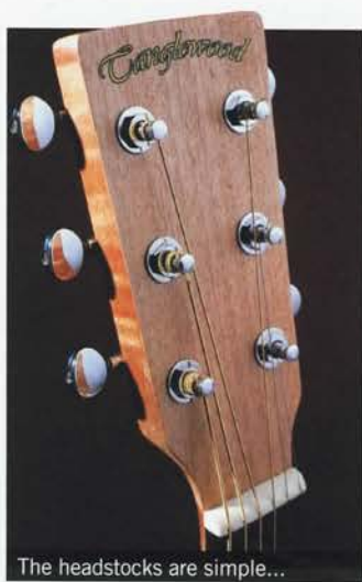
The headstocks are simple...