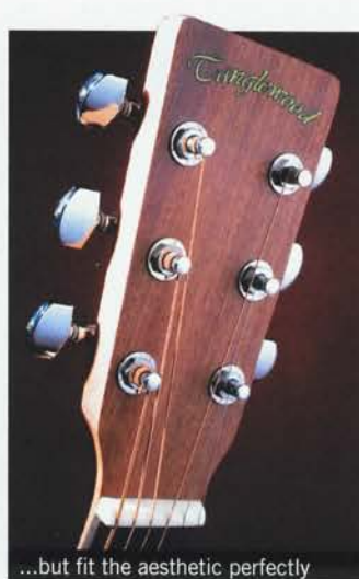
...but fit the aesthetic perfectly